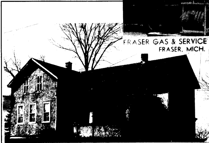
FRASER GAS & SERVICE STATION FRASER, MICH.

If you really don't remember, then be sure to see the bulletin board at the annual picnic