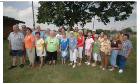
1955 through 1959