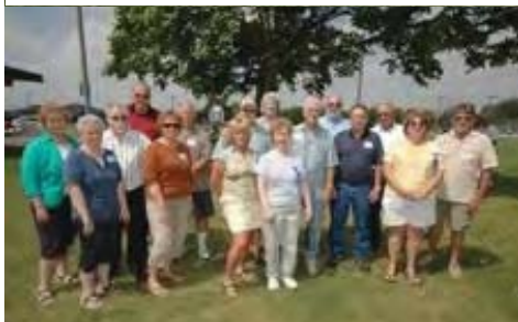
1960 through 1964