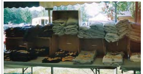
Clothing with the Fraser logo