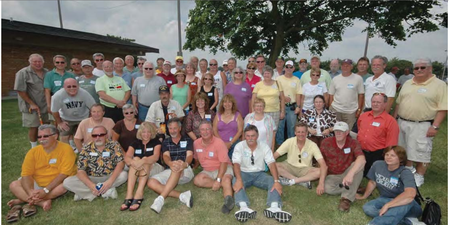
The gang from 1965 through 1969